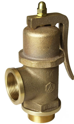
Subject to modifications