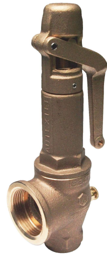
Subject to modifications