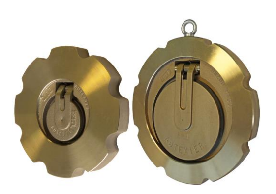
111 and AU111