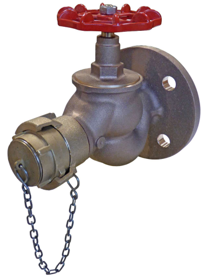
Subject to modifications Photo for information only