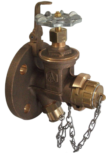
Subject to modifications