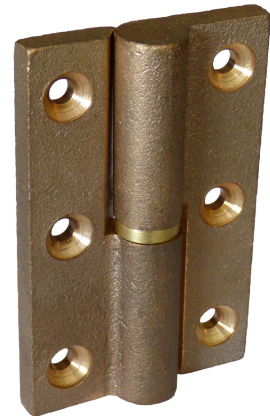
Subject to modifications