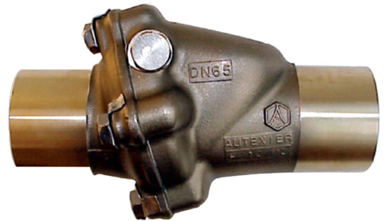
Subject to modifications