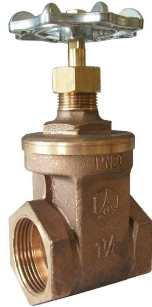
Subject to modifications