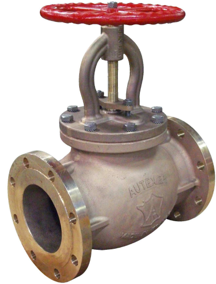
Subject to modifications Photo for information only