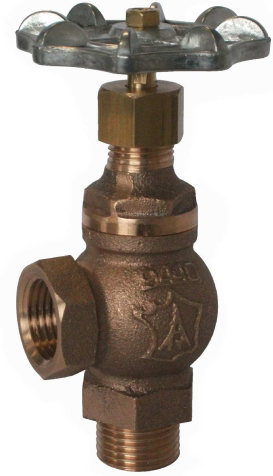
Subject to modifications