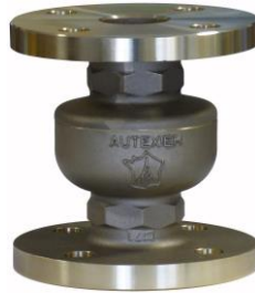
113 and AU113