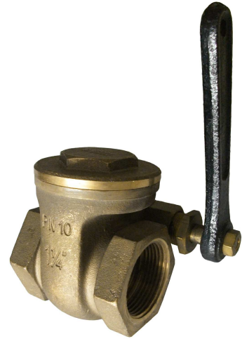
Subject to modifications