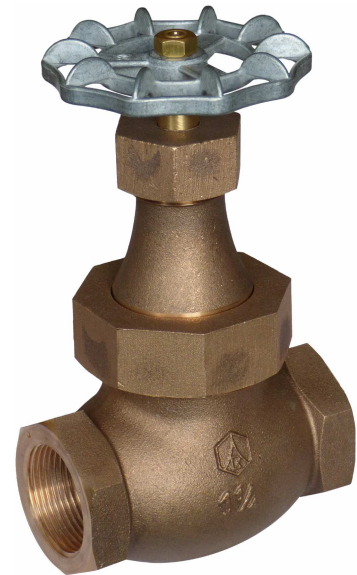
Subject to modifications