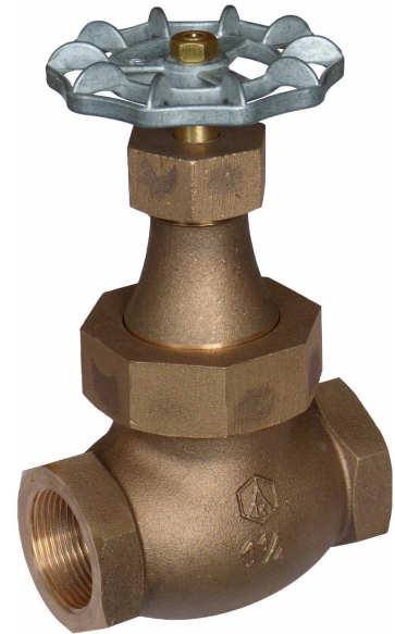
Subject to modifications