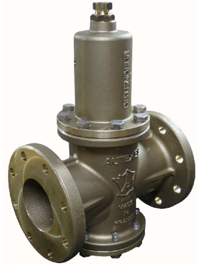
Subject to modifications